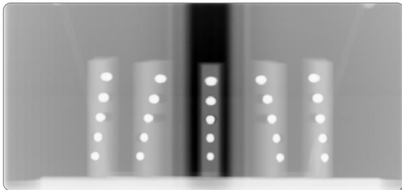
fig. 1 Radiograph of TO PAN