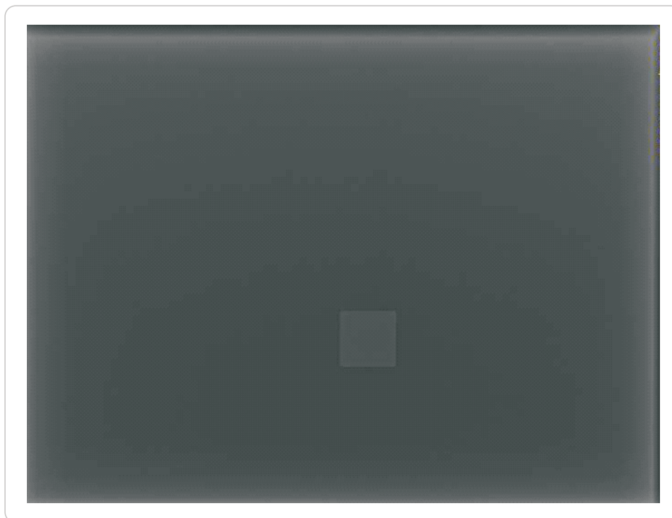
fig. 1 PIXMAM X-ray